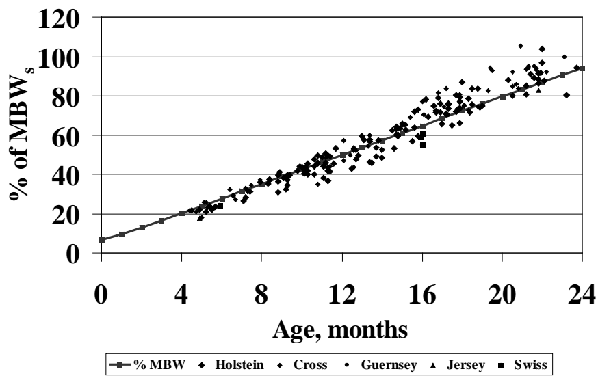
Figure 2. Mature body weight (MBW s ) relationship of 168 heifers from the Marshfield Agricultural Research Station, University of