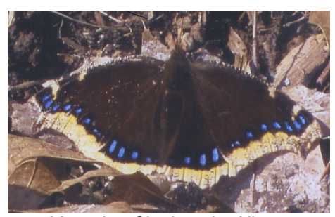
Mourning Cloak on leaf litter

Many butterflies survive Wisconsin winters by entering a state called "diapause." Their bodies manufacture an internal antifreeze that protects their cells and keeps them from freezing over the winter.