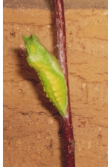
Black Swallowtail Chrysalis

This publication is produced by Master Gardener Volunteers of the University of Wisconsin Extension using University research based information. Contact the UW-Extension office in your